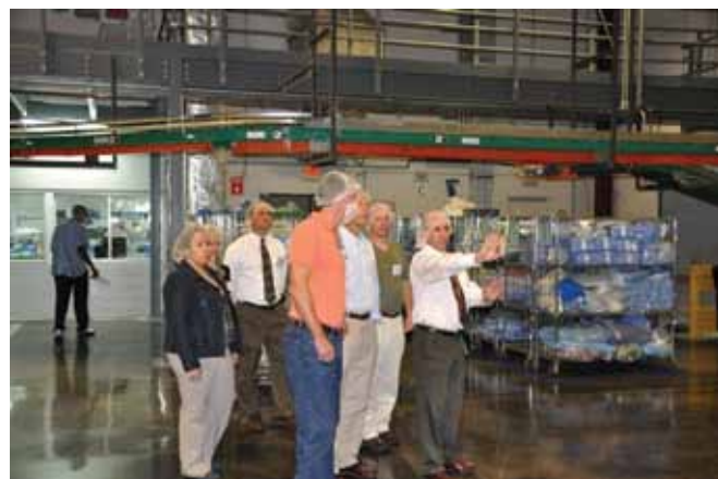
AVID Medical recently celebrated its second expansion in five years in James City County. The company held an open house and provided tours of its custom surgical procedural tray operation.

Founded in 1998, AVID Medical sells custom procedural trays for surgical, cardio catheterization and labor-and-delivery procedures to approximately 800 hospitals, ambulatory surgery centers, government medical facilities, and organ and tissue procurement agencies. ■