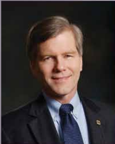
Governor Bob McDonnell

A Publication of the Virginia Economic Development Partnership Winter 2010, Vol.15, Issue 1