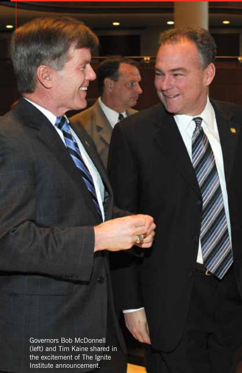
Governors Bob McDonnell (left) and Tim Kaine shared in the excitement of The Ignite Institute announcement.