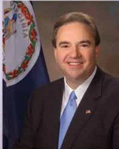
Lt. Governor Bill Bolling