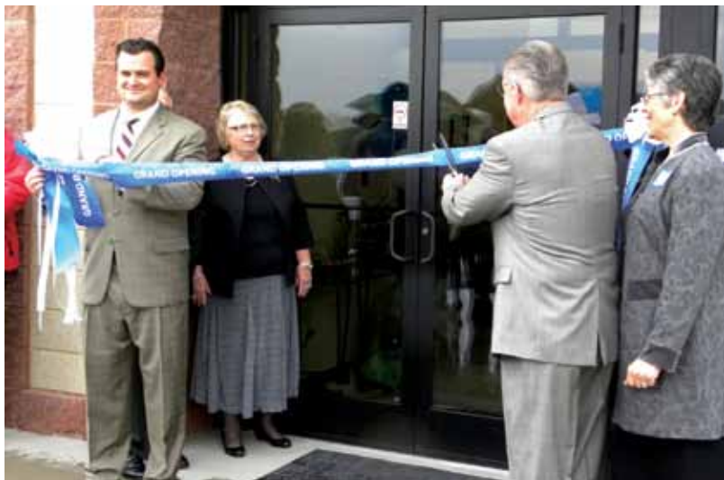
Officials cut the ribbon at the Inorganic Ventures Grand Opening in Montgomery County.

Inorganic Ventures is the leading custom inorganic chemical standards manufacturer in the United States, preparing custom and conventional chemical standards for companies around the world. Privately held and founded in 1990, Inorganic Ventures can prepare almost any inorganic chemical blend and can tailor the chemical blend to fit its customers' specifications. ■